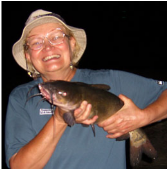
My first salmon! (Well, it WAS dark!)

It wasn't a long fight, but I had never had such a powerful fish opposite me before. At 50 something and female, one is well aware of the balance between effort and pain, as most of us that age are, but I was able to meet the encounter with an equal amount of necessary capacity. We fought the fish around to the end of the pier where Kevin could get the long-poled net to the water, and I pulled the fish into the net.