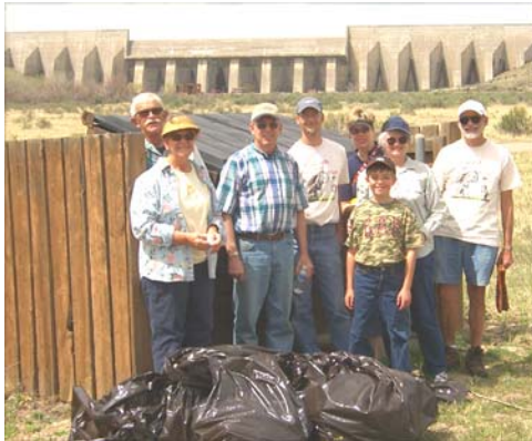
Part of the Cleanup Crew that could be rounded up for a photo ...